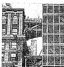
New Tower Takes Shape on Columbia Campus