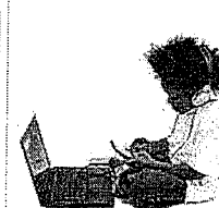
18 and Under: Texting, Surfing, Studying?