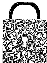
Op-Ed: To Catch a Looter