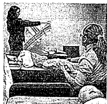
Much Is Asked, Little Defined for the Nanny